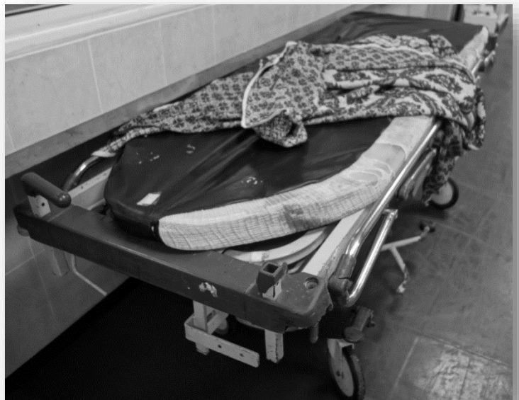
Shifa Hospital, OR, night shift, June 2014: a totally deranged patient trolley, used to take surgical patients into the clean OR.

The Shifa Hospital staff have been through an extreme historical period. The two Intifadas, the Israeli military attacks in 2006, 2008-09 and 2012; the inter-Palestinian conflict and the siege from 2007, have together placed almost insurmountable burdens and extreme challenges on top of the daily medical work. Large flows of emergency cases and extreme war trauma have pushed the staff and the hospital's capacity to its limits. Still, they have performed well and managed to implement substantial, operational improvements with a high precision in mass casualty triage. In Nov 2012, a large influx of patients who had war trauma was managed in Al-Shifa Hospital despite the erosion of infrastructure, supplies, and general population health from the previous 5-year Israeli siege. Improved, stricter triage reduced patient admission during the 2012 Israeli military attack versus the Israeli military attacks in 2008—09. Additionally, hospital staff were better